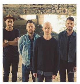
The Fray, Animal Years Bring Star Power to AirVenture 2019 Opening-Night Concert

A roster of legendary American military aircraft in history, from iconic World War II airplanes to today's most sophisticated flying machines, will be on display at AirVenture 2019.