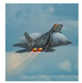
"Year of the Fighter" at AirVenture 2019

A roster of legendary American military aircraft in history, from iconic World War II airplanes to today's most sophisticated flying machines, will be on display at AirVenture 2019.