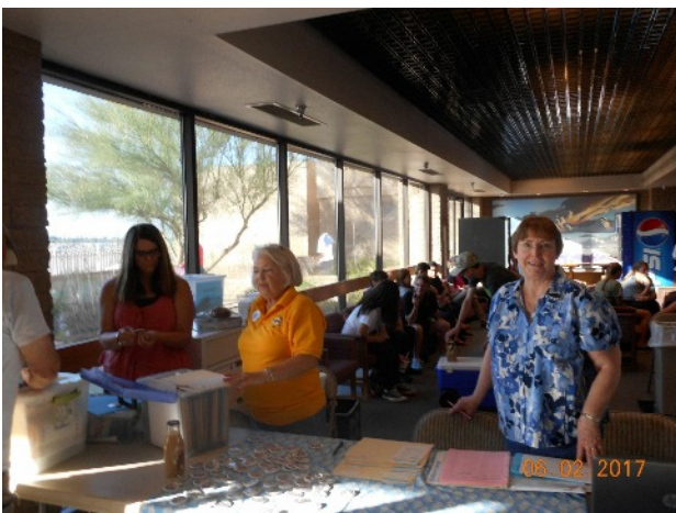
Our Wonderful Coordinators