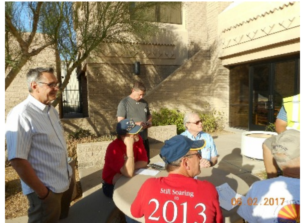
Pilot Briefing on the Patio.