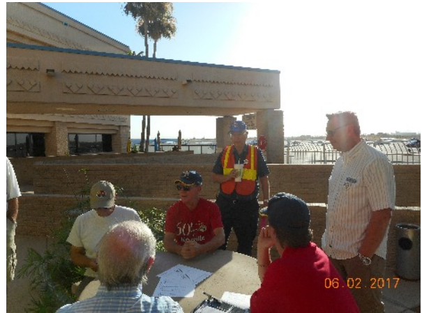
Awaiting flight times.