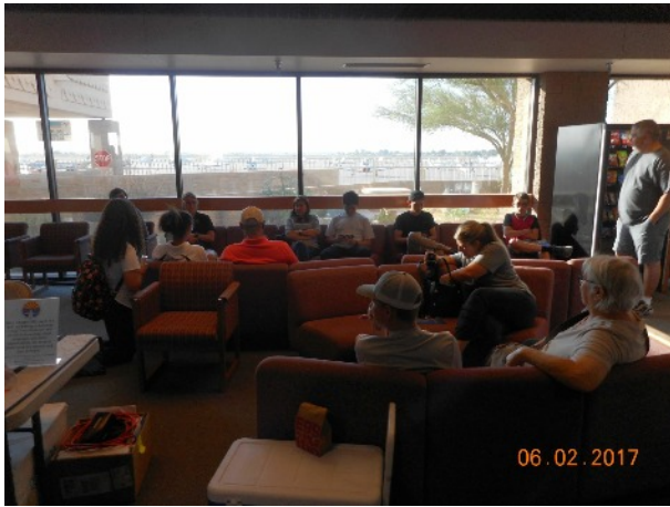
Young Eagles Pictures