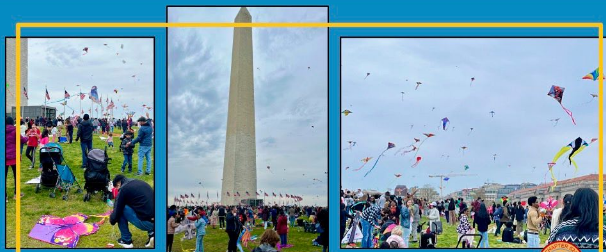
2024 Blossom Kite Festival in Washington DC