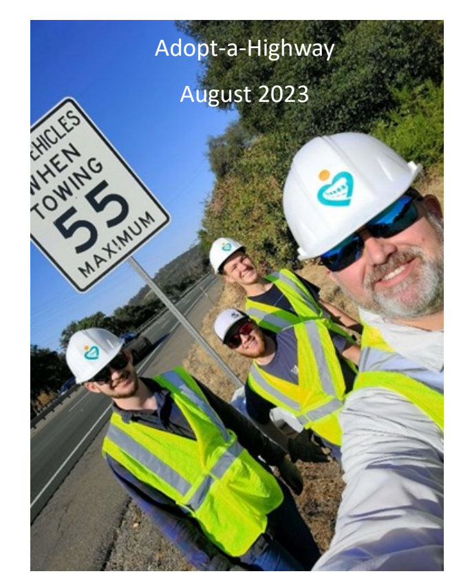
Me, upper far left volunteering for Adopt-A-Highway

I regularly share my flight experiences and information on the Young Eagles program, Sporty's Online Groundschool, and the Ray Scholarship program to others interested in learning to fly and potentially becoming a Ray Scholar in their journey.