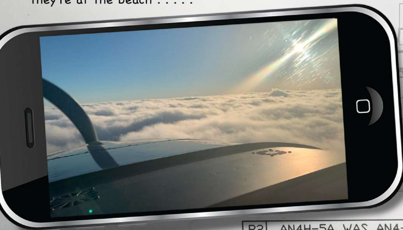
The view from an RV-14 crossing West Virginia at 10,000ft.

Their excuse is to help a fellow RV builder install his wings but I'll bet they're at the beach . . . . .