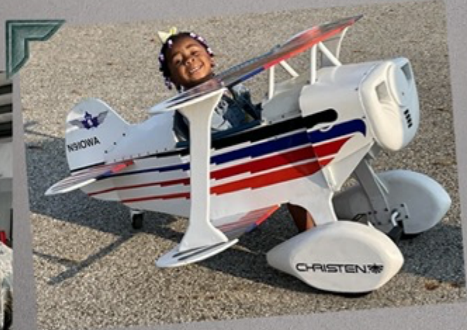
Just wait, in 20 years she will be an airline captain!