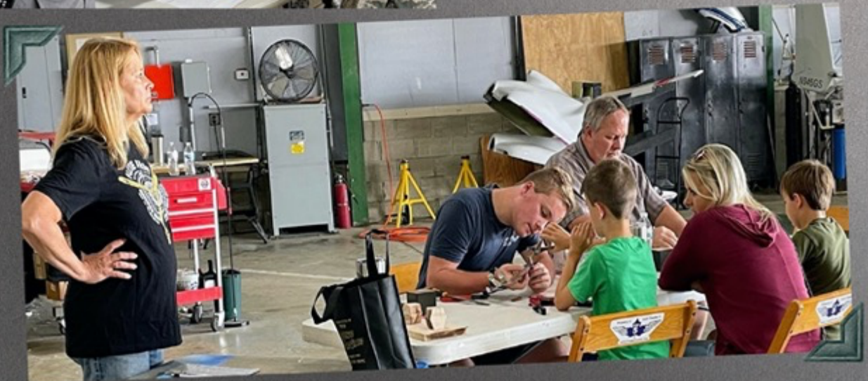
The WENNER family helps kids build rivet planes