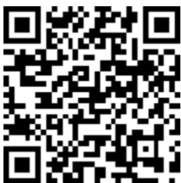
Donation QR Code for EAA Chapter 478

We need a volunteer to provide a container for worn out aircraft tires that can be re-treaded. The container would be placed outside of Sid Wood's hangar as agreed to by 2W6 management. Not anything too elaborate, simply something with Signage and a lid to protect from the elements. It should hold about 20 tires. These tires can be recycled for $5.00. This tire recycling effort is a fund raising opportunity for the Chapter. If you are willing to build a box or if a group of Chapter Members are willing to build a box, let me know.