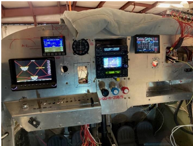
Photo 2. We have started to configure the Garmin 430W so it can receive a GPS signal. There are a lot of steps involved in this configuration to get all of the inputs and outputs to the various attached devices. The JPI engine monitor has been temporally attached and powered up (there is no engine attached to the airframe at this point). Various locations are being finalized for some of the control knobs and USB jacks for the pilots convenience.