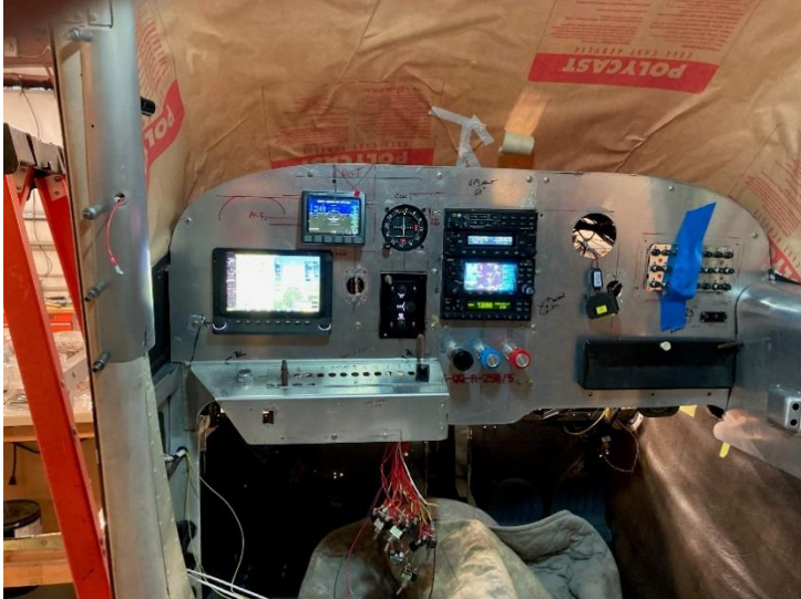
Photo 1. The new avionics / radio stack is all wired and installed in the new design instrument panel. It is powered on for the first time. NO SMOKE.