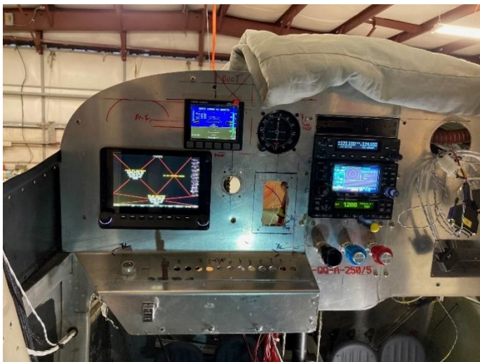
Photo 3. LOOKING GOOD! The Certified Dynon HDX system is now configured and talking to the Garmin 430W. Inside the metal hangar we are receiving 5 GPS sats and receiving a strong signal. Some of the cabin side panels have been fabricated and locations for the microphone and headset jacks finalized. All of the audio jacks have been wired to the PS Engineering Audio Panel. The two Com radios are functioning and the Nav selection is picking up the glide slope as shown on the CDI. The new windshield has been cut, trimmed, and clecoed in place.