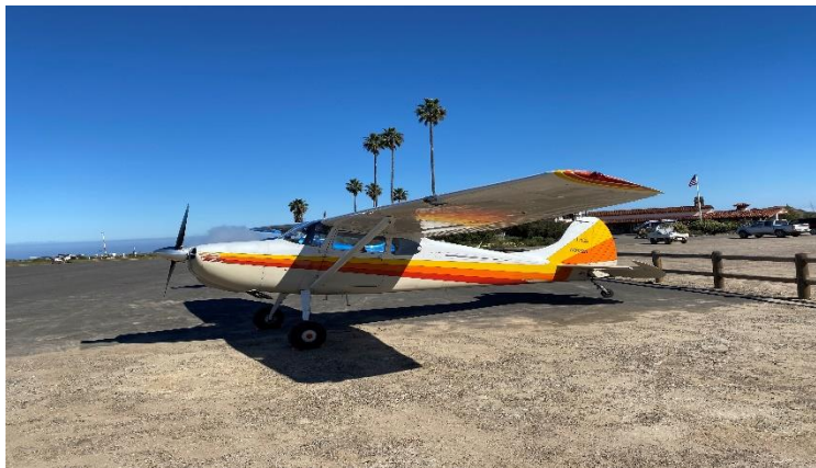
Darrell's Cessna 170

All EAA465 sponsored activities require face coverings plus social distancing when possible.