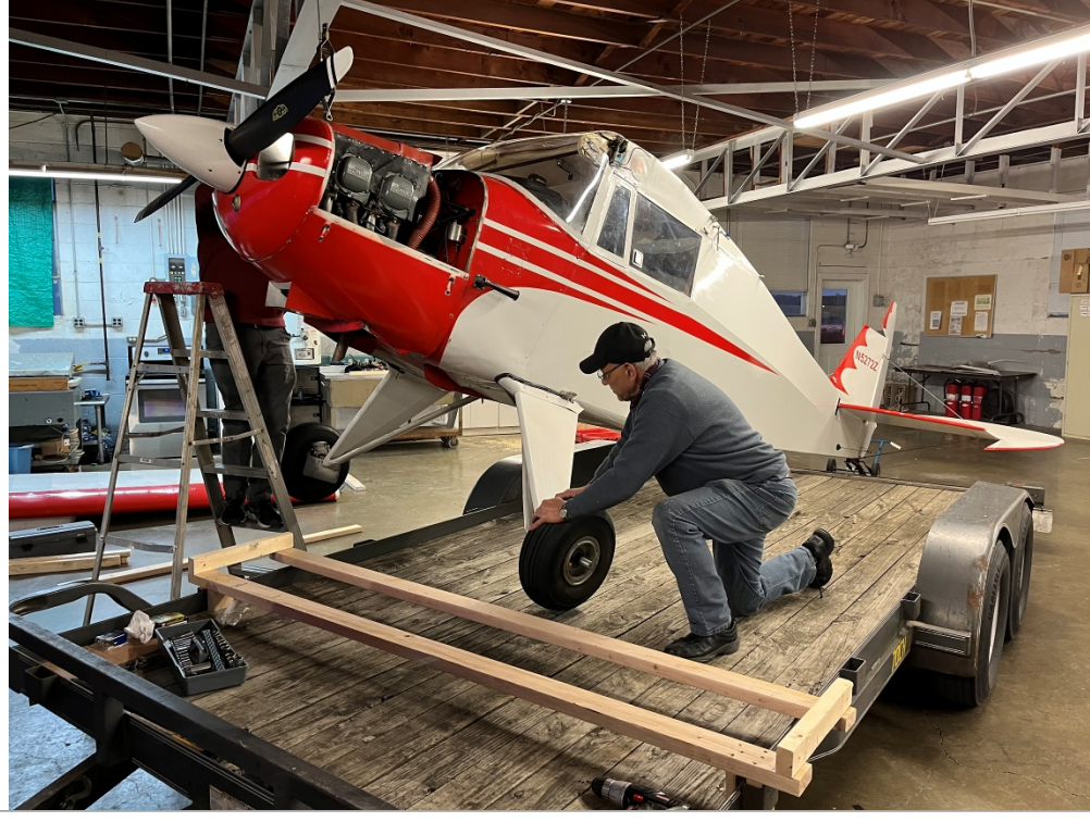
The Flyer - Monthly Newsletter for EAA Chapter 44

Editor: There is more info on this trip in the January 2023 issue of The Flyer.