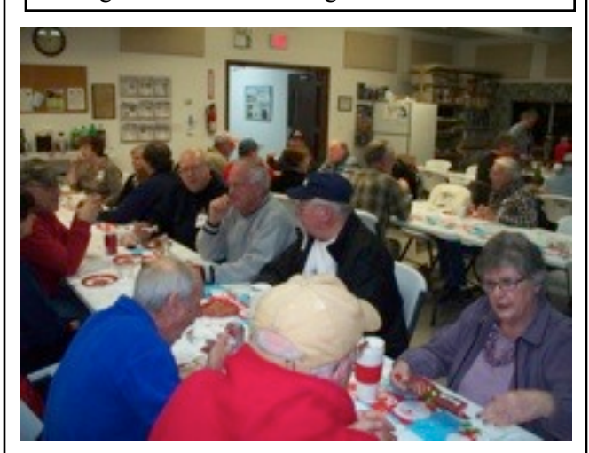
Friends enjoy each others company during the holidays.