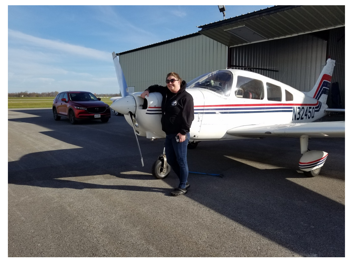
The Flyer - Monthly Newsletter for EAA Chapter 44