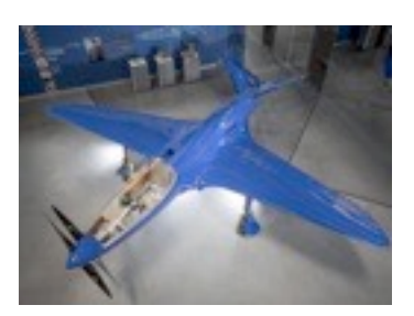
It's a Bugatti 100P (above). Ed.