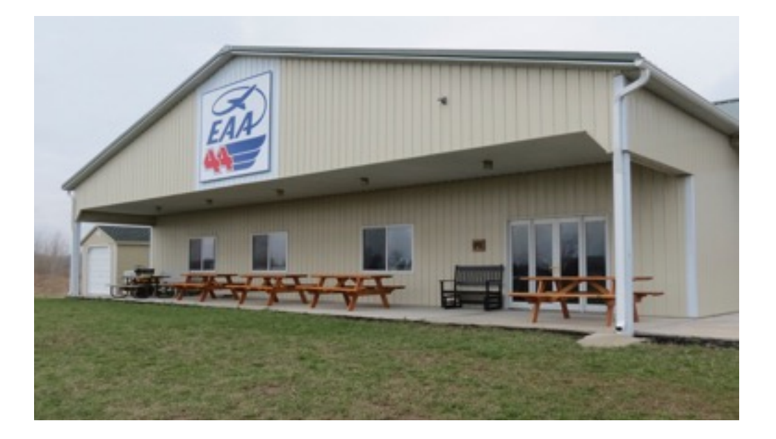
SAC and shed with Ron Logory's picnic tables on Phil's Porch.

In 2013 we FINALLY hung all the interior doors (from the demolished Genesee Hospital) and painted the hallway runway (We still need Hold Short markings between the shop and hallway.) The Board decided that even with our new huge building, it wasn't enough. so we bought a shed for all the ...STUFF... we didn't want in the SAC proper. That summer Gail Isaac landscaped and planted our front entrance garden. If you look at it carefully and squint your eyes, the shape of the garden is that of Concorde! Before the snow started flying, we installed our two building signs on the south and east sides facing the runway/taxiway and the ramp identifying our presence at the airport.