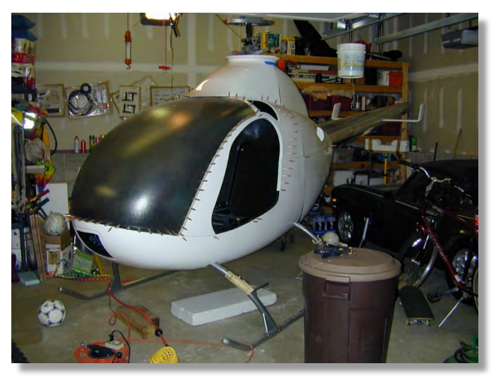
Early days in NJ – Clecos and fiberglass

We relocated to NJ, helicopter parts and all, in 2000. I made decent progress on the build for a couple of years, but work obligations and kids' sports, band concerts and Boy Scouts edged out rivets and fiberglass, and work proceeded in fits and starts. Eventually the kids grew up, we retired, and with more time on my hands, work resumed. We relocated to Hamlin in 2016, and pushed hard until the build was complete in 2019. There were a number of periods of panic as Rotorway went in and out of business several times and parts and advice became scarce, but the Rotorway Owners forum