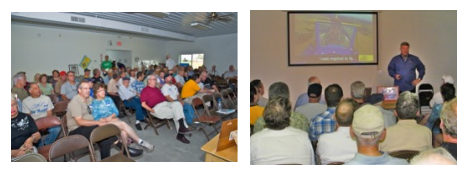
Grassroots Pilots Tour with Rod Hightower- Notice the bare walls in the Great Room.

We held our first public events in June 2011, the Grassroots Pilots Tour with EAA President Rod Hightower and the Grand Opening and Dedication of the SAC. But we still weren't finished inside, and outside for that matter with the landscaping. The drywall was up but there were few doors except in the Great Room and bathrooms. But we cleaned up as best we could for company and showed off our new home... a work in progress but usable.