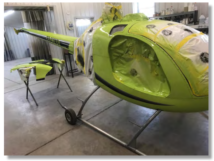
In the Paint shop

We keep the aircraft in a pole barn we have in on 5 acres – remember, I don't need a runway. All the flying is in the FAA defined bubble. So far I've been to Ledgedale for some touchand-go's, flown over the lakeshore and our house, and around