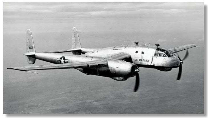
Tested extensively during 1950. Details are on page 5.