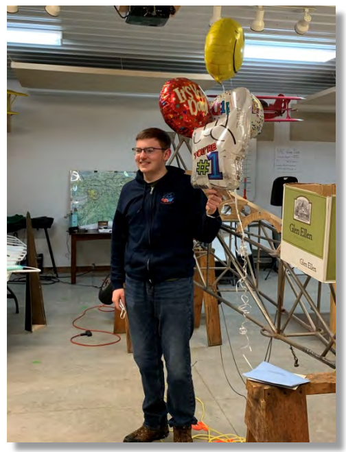
Celebrating with Chapter 44 members

I have flown twice since my exam, and although I've flown solo before, it's a different experience when I don't need to get an endorsement from my