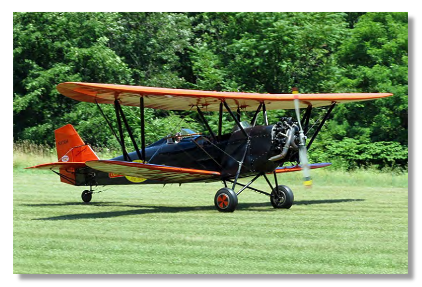
The 1929 New Standard D-25 is available for rides, and can carry up to four passengers per flight

on the wing. As he reaches in to push the throttle and fight with the pilot they disappear at the end of the runway chased by some Keystone Cop type characters. In the confusion the real convict is exchanged for a dummy connected to the right wing struts. The Fleet then takes off and drops the dummy over the village when a cop fires a shot gun shooting the crook out of the air. The first time doing this act you wonder how the airplane is going to react to this full size dummy whirling around way out there off the wing.