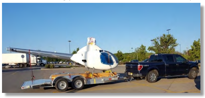
Pauls project on the move from NJ to Hamlin NY

The Super Hornet, while visually similar to the "legacy" Hornet, is essentially a new aircraft. It is approximately 20% larger, 7,000 lbs heavier empty weight, and 15,000 lbs heavier maximum weight than the original airframe. The Super Hornet can carry 33% more internal fuel, increasing mission range by 41% and endurance by 50% over its predecessor. A unique design characteristic of the Super Hornet is that it can be equipped with an aerial refueling system (ARS) or "buddy store" for the refueling of other aircraft, giving it another layer of versatility.