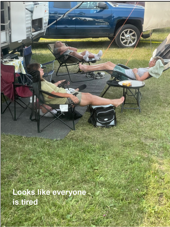
Looks like everyone is tired