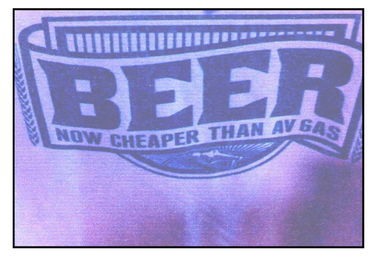
On a serious note. What's in your tank?