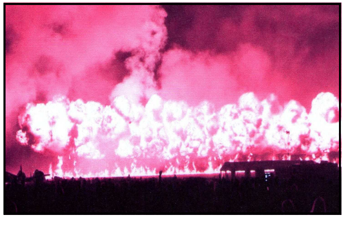
Tragedy: One small spark sets all the Porta Pottys on fire.