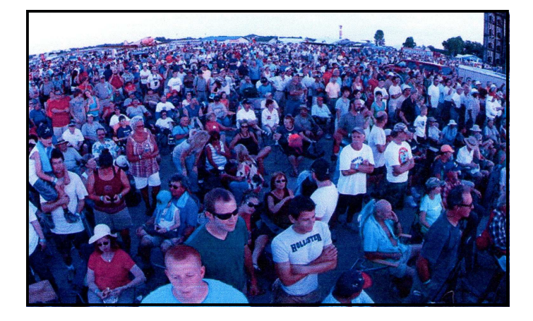
Where's Waldo or Steve Beach?