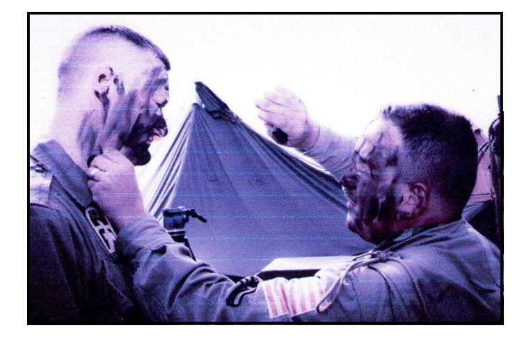
Just a little more and we can sneak into the concert.