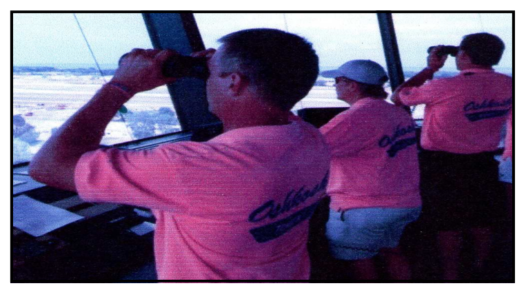
Check out that babe next to the Cub.