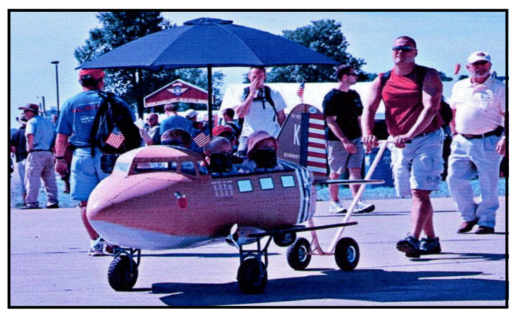
Got to get here early to get the good strollers.