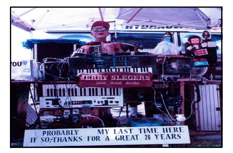
Opening act for Steve Miller Band.