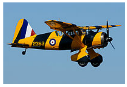
Name This Airplane—answer on p.3