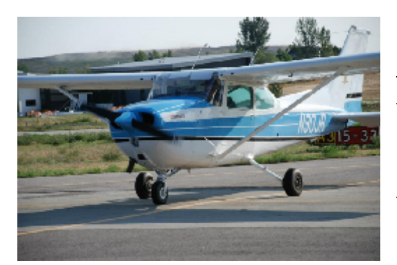
Registration: N90JR Type: Single Engine Year: 1979 Make: Cessna Model: 172 Skyhawk II Aircraft Location: Erie, Colorado