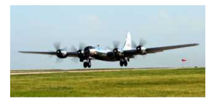
July 17, 2016 Wichita, Kansas