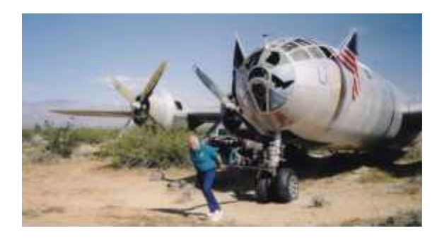
1998, Mojave Desert

Many of us have followed the extensive and prolonged restoration of the B-29 'Doc' at McConnell AFB in Wichita, Kansas. The whole process took 12 years of paper work to get 'Doc' released from the China Lake target range in 1998 and 18 more years until restoration was completed. I think we all felt a degree of excitement at Doc's first flight in 60 years on July 17<sup>th</sup> 2016 after the rebuild and look forward to seeing Doc at AirVenture in the near future. One of the crews from FiFi conducted the first flight.