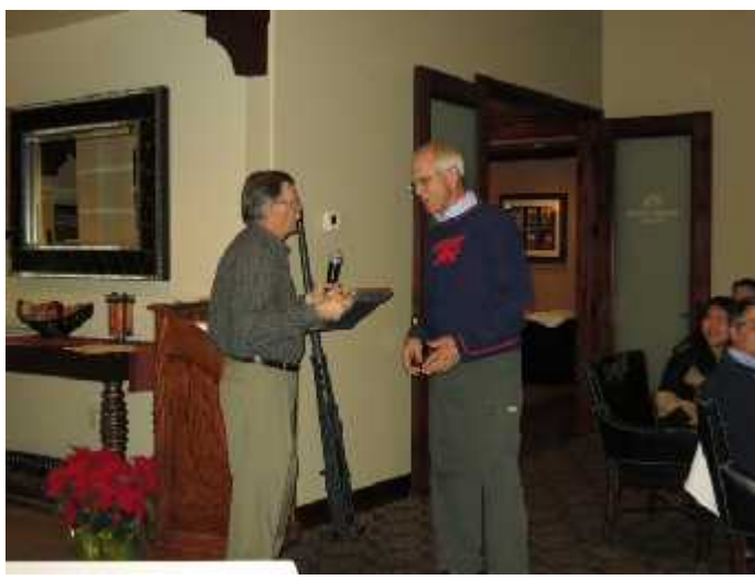
(Continued on page 6...)