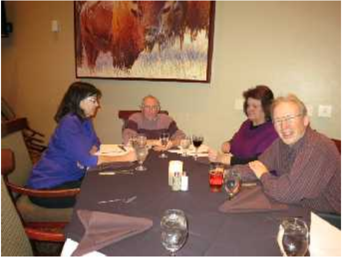
(Continued on page 4...)