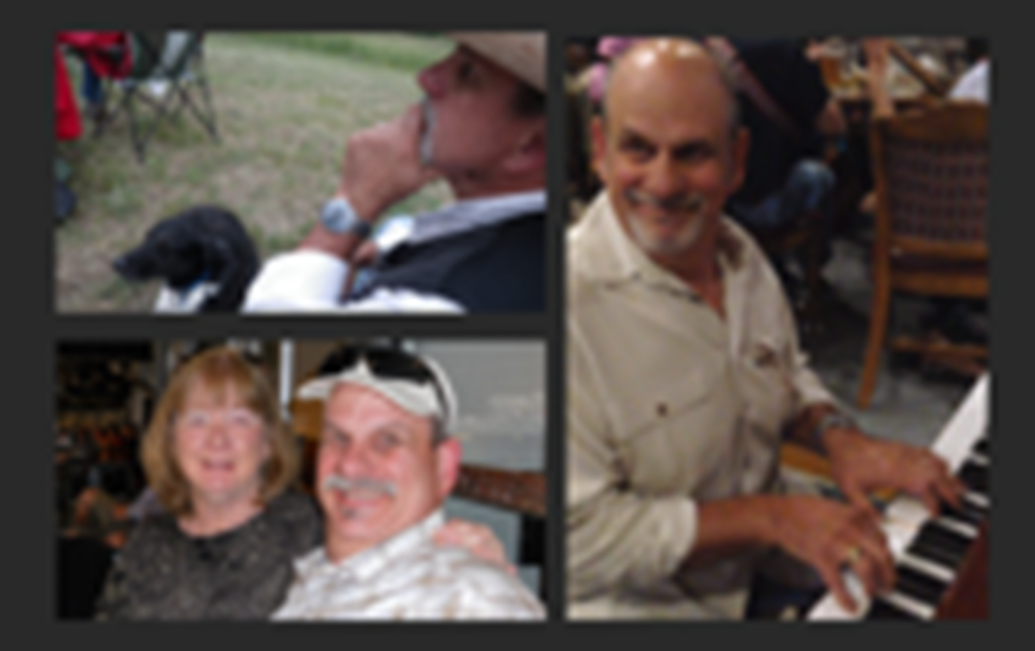
OCTOBER 13, 1953 - JUNE 02, 2023