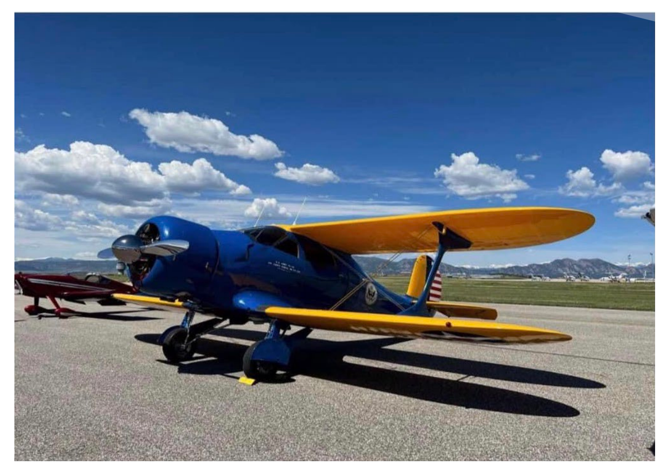
Beech Model 17 Staggerwing