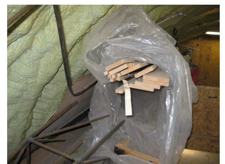
Hatz CB-1 Cont'd