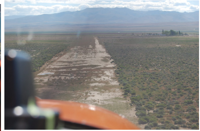
Quite the landing strip, wouldn't you say? Gravel Valley, California