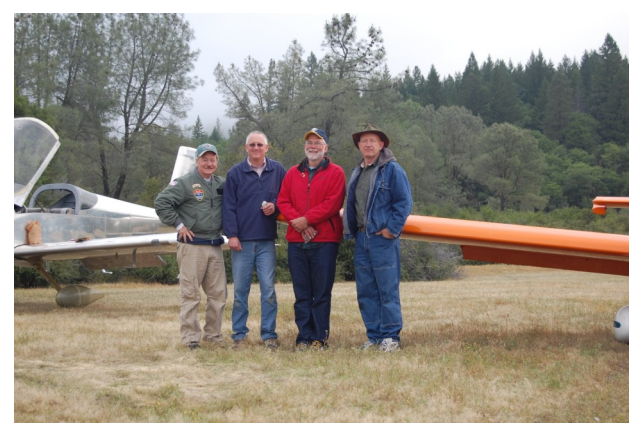
Let's all pose before we head home to Idaho.

Please share your newsletter with your <u>spouse</u>, your <u>family</u>, and your <u>flying</u> <u>friends!</u>!