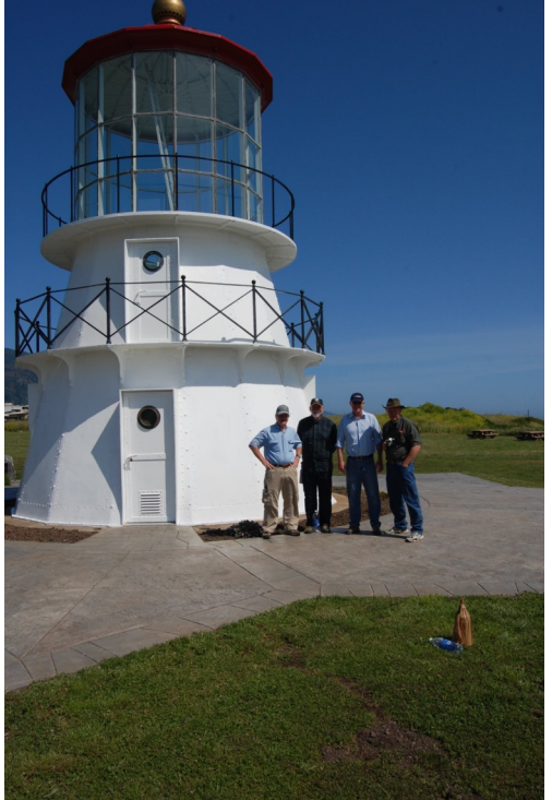
Historic Lighthouse @ Shelter Cove. We all got a great tour inside!