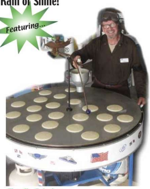
Floyd's Fabulous Flying Flapjack Machine!