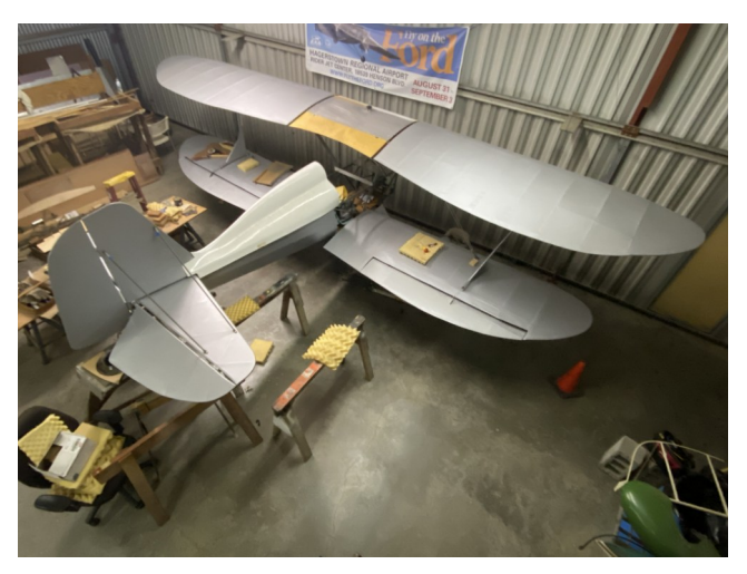
A recent photo highlighting the progress made on the Stolp SA-900 V-Star.