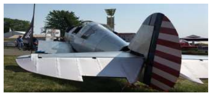
prototype. Lota of interest.