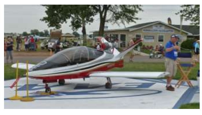
Many jets; lots of electrics