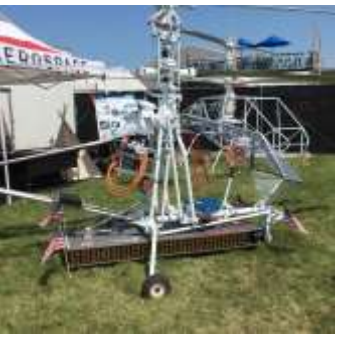
A stand up e-helicopter