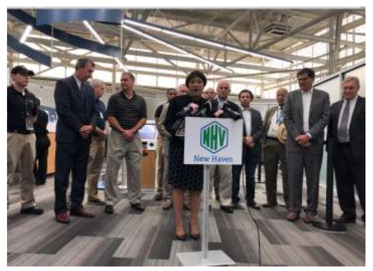
New Haven Mayor Toni Harp speaking at a press conference at Tweed New Haven Airport

A federal appeals court ruled in favor of Tweed New Haven airport following a lengthy lawsuit seeking to extend the runway and attract additional service to the area. New Haven Mayor Toni Harp said the ruling by the 2nd U.S. Circuit Court of Appeals in New York aligns with her vision for the city's economic development plan. "Make no mistake, my administration is pleased with this decision," Harp announced during a packed press conference at the airport. "We hope today's ruling signals the first step on a path toward improved air service to an estimated one million airline passengers in this market."