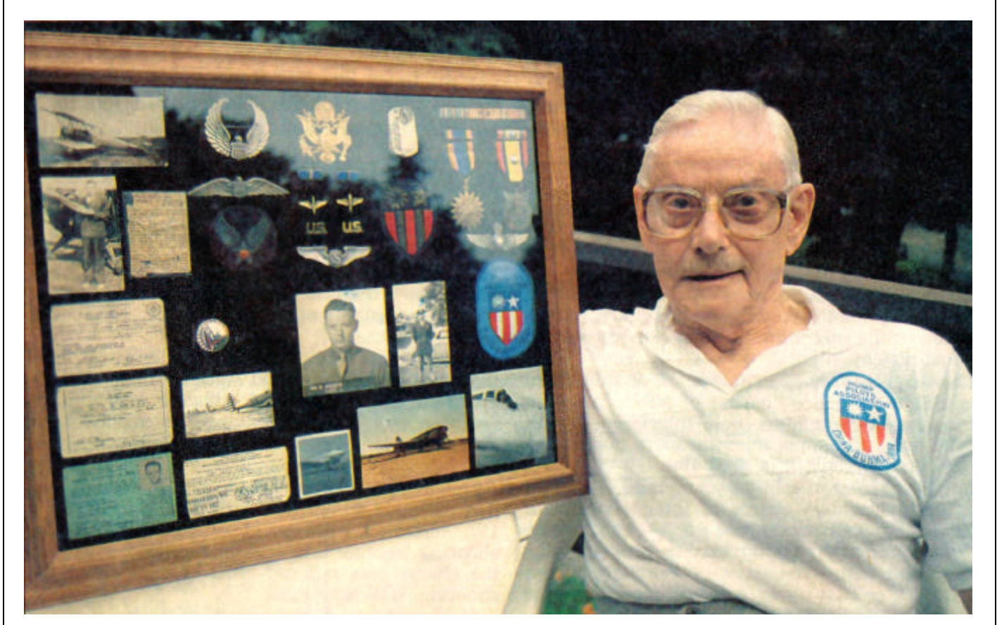
Red with mementoes of over four decades of flying.