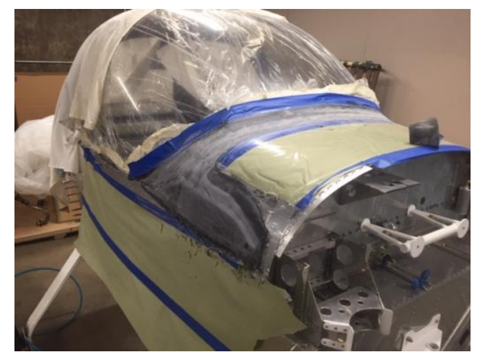
Fiberglassing the canopy frame.