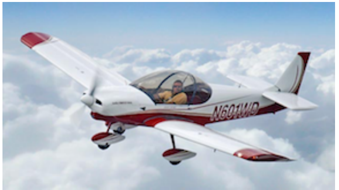
Zenith CH 650 Aircraft (sample photo)

Bill (Zenith 650): Bill just bought this beautiful example of a Light Sport build. If you'd like to take a look at the workmanship, contact Bill and he'd be happy to show it off!