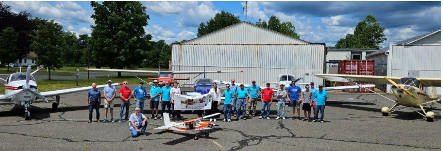
Group shot after the event