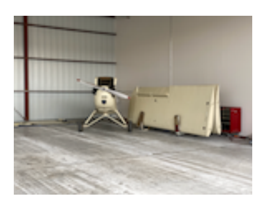
EAA 324 Nov-Dec 2020 Newsletter