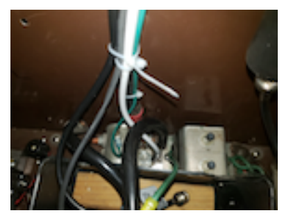
and here's a pic of the old one!