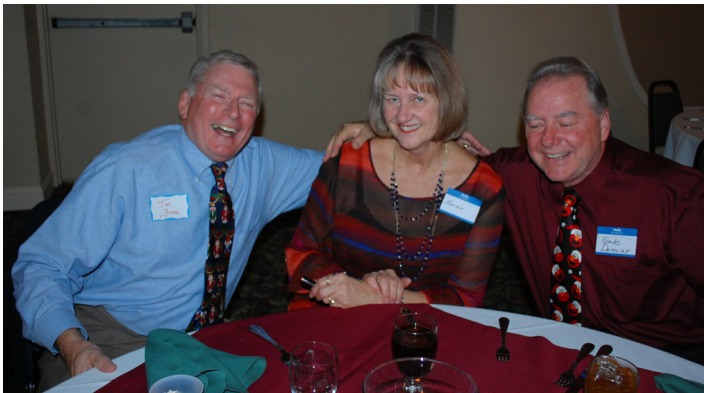
“A Rose between two thorns!”

There were others at this party sampling the special brew called Finley's Firewater. Some sampling was going on and.....well one picture is worth a thousand words!