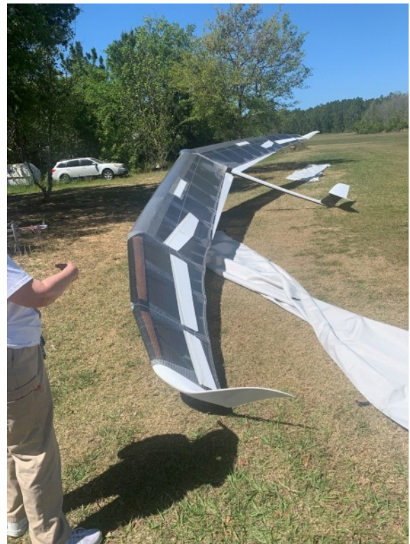
The highly advanced hang glider on its wing cover

Later that day was a visit to the Wallaby Ranch Hang Glider Ranch in Davenport, FL. This is the coolest place and the most purest form of flying. Needless to say, the boyz took off in their ATOS-VR hang gliders and they were up for some time. These highly engineered hang gliders have a bunch of Carbon Fiber, Spoilerons, aerodynamic struts, and cannot be broken down and collapsed into a car rack travel size due to all the drag reduction features built into the structure.