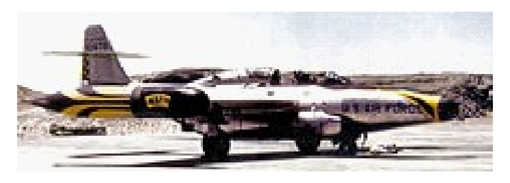
Northrop F-89D Scorpion of the 437th Fighter Intercept Squadron stationed at Oxnard AFB California 1956.

During the incident over 1000 acres were scorched and a substantial amount of property was damaged or destroyed.