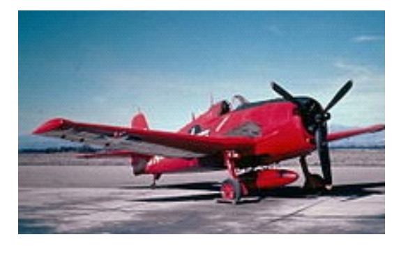
Grumman F6F-5K drone

In the mid-1950s, the United States Navy was involved in research and development on surface-to-air and air-to-air missiles for the protection of its ships and other assets. The missiles being tested at this time included the AIM-7 Sparrow and the Bendix AAM-N-10 Eagle. Unmanned drones were used to test the missiles' effectiveness. One type of drone was the Grumman F6F-5K Hellcat.