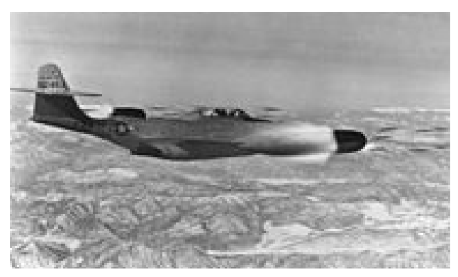
F-89D firing Mighty Mouse Rockets

western section of the mostly uninhabited Antelope Valley. The attackers attempted to fire in automatic mode several times, but due to a design flaw in the firecontrol system the rockets failed to launch.