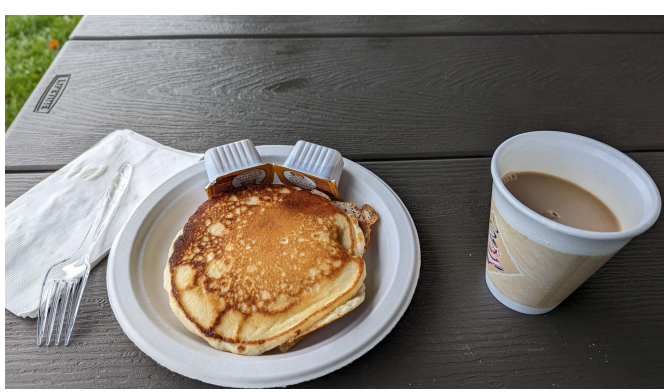
Pumpkin Fly in at Golden Age Museum in Grimes