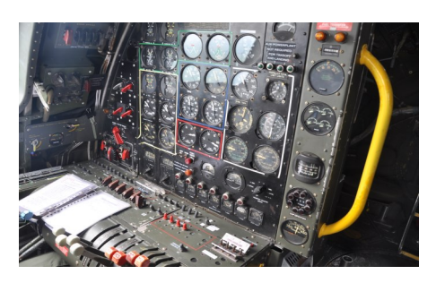
B-29 Engine control panel by flight Engineer

Aerial View Catfish Bay bottom of picture