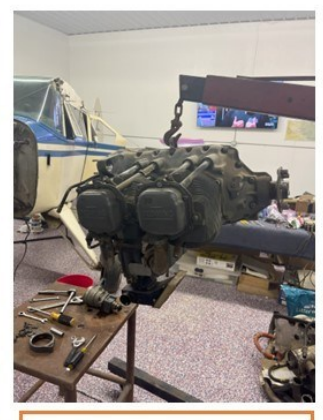
Engine removed and was in 100 pieces mere moments after this picture!