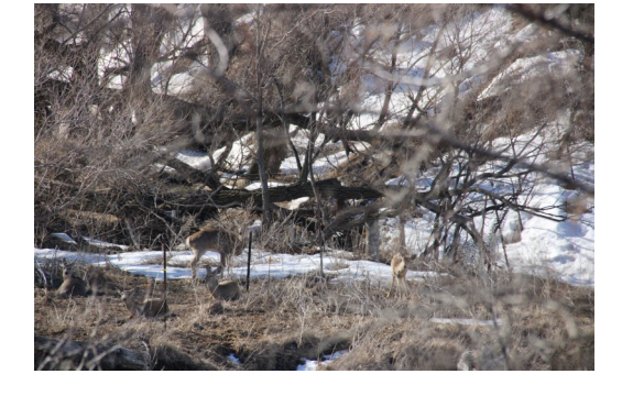
Deer by Humane Society Benson Rd 4-2-2023