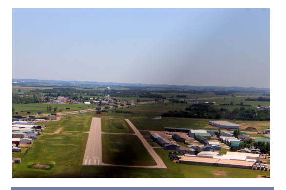
EAA Chapter 289, Lincoln County Airport, & Chapter Hangar Below Tea, SD

E-mail to <a href="mailto:pethau@sio.midco.net">pethau@sio.midco.net</a> Or send to EAA 289, PO Box 89105, Sioux Falls, SD 57109