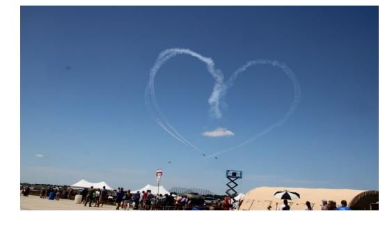
Vanguard Squadron at SF Airshow 2023