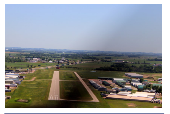
EAA Chapter 289, Lincoln County Airport, & Chapter Hangar Below Tea, SD

E-mail to pethau@sio.midco.net Or send to EAA 289, PO Box 89105, Sioux Falls, SD 57109