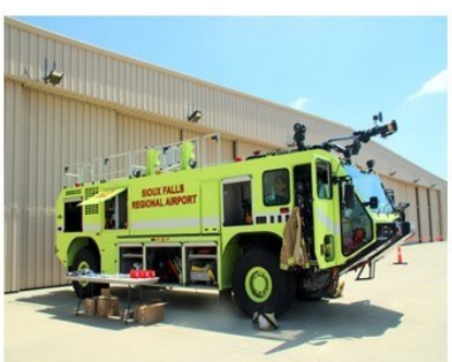
SF Airport Fire Truck