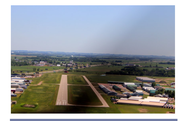
EAA Chapter 289, Lincoln County Airport, & Chapter Hangar Below Tea, SD

E-mail to <a href="mailto:pethau@sio.midco.net">pethau@sio.midco.net</a> Or send to EAA 289, PO Box 89105, Sioux Falls, SD 57109