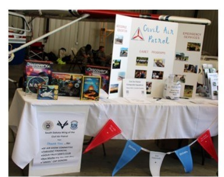
Civil Air Patrol Booth

It was busy day with families drive in along school bus delivering kids. Temp was close to 100 degrees with high humidity.