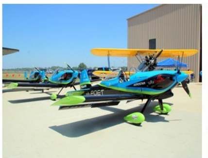
Vanguard Squadron, Tea Airport