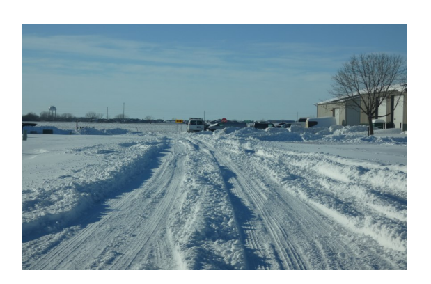
Snowy street going to the hangar