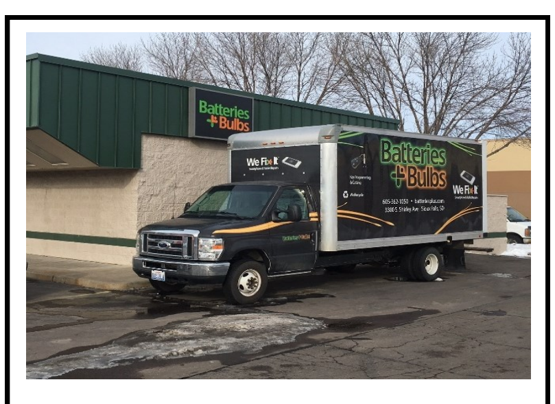
Batteries + Bulbs WE FIX IT 605/362-1050

CAP Lobos Facebook: https://www.facebook.com/lincolncap/