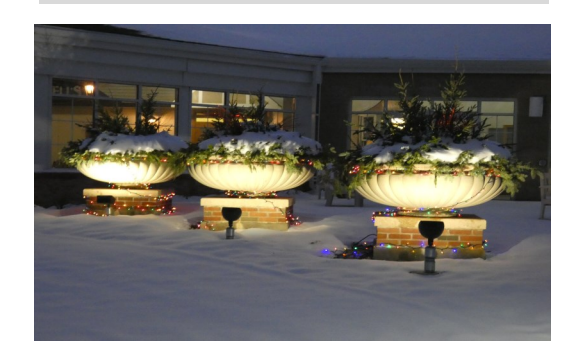
Christmas Lights Dow Rummel Sioux Falls, SD