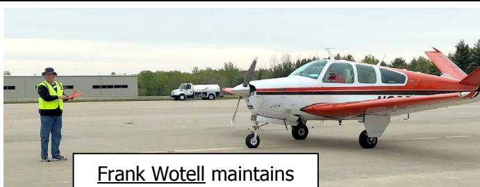
Frank Wotell maintains order on the ramp