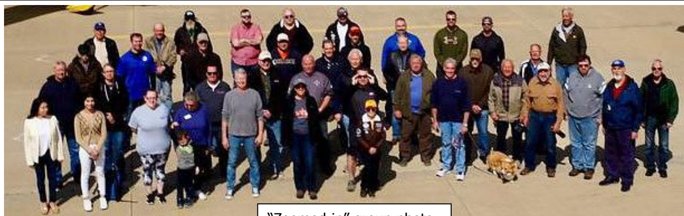
"Zoomed-in" group photo