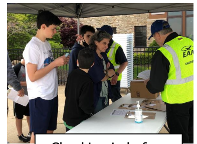
Checking in before going on the ramp