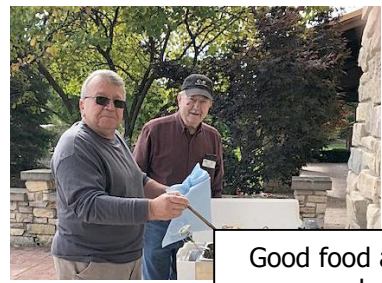
Good food and camaraderie

We invite you to attend one of our meetings and meet our members.