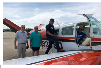
Ready to fly on a Poker Run