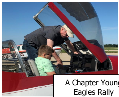
A Chapter Young Eagles Rally