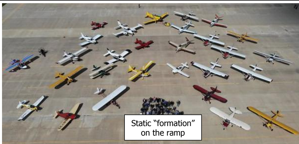
Static "formation" on the ramp

On Saturday May 8 th it was a sun filled morning for the EAA Chapter 260 group photo shoot at Bult Field. Quite a few pilots and their airplanes were present. Both aerial and ground photos were taken. Some are included below.