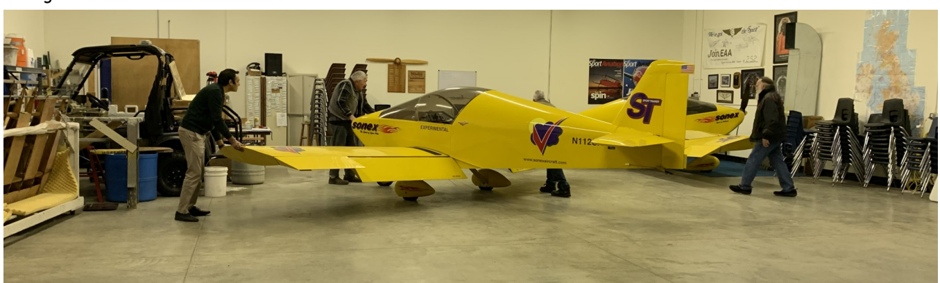
Tucking in one of our Sonex hangar tenants after the meeting.