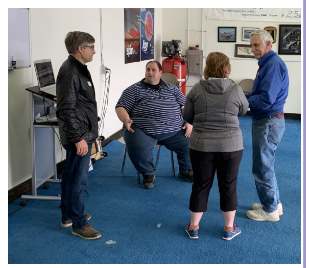
When an EAA meeting is interrupted by airplane noise, it's a good thing!