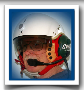
30 YEARS AGO May 1985

From the Minutes of EAA Meeting, May 17, 1985 NRC, Sussex Drive: