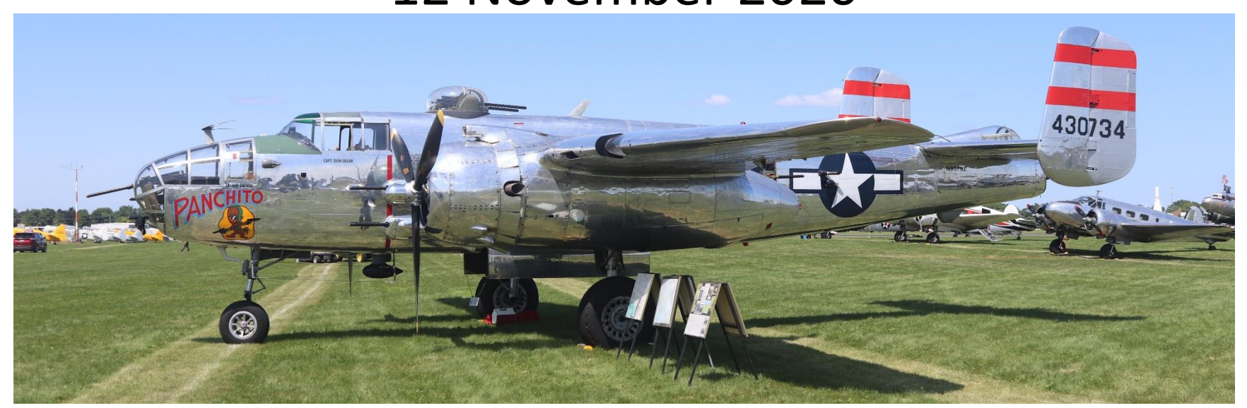
North American B-25H Mitchell at Oshkosh 22 July 2019