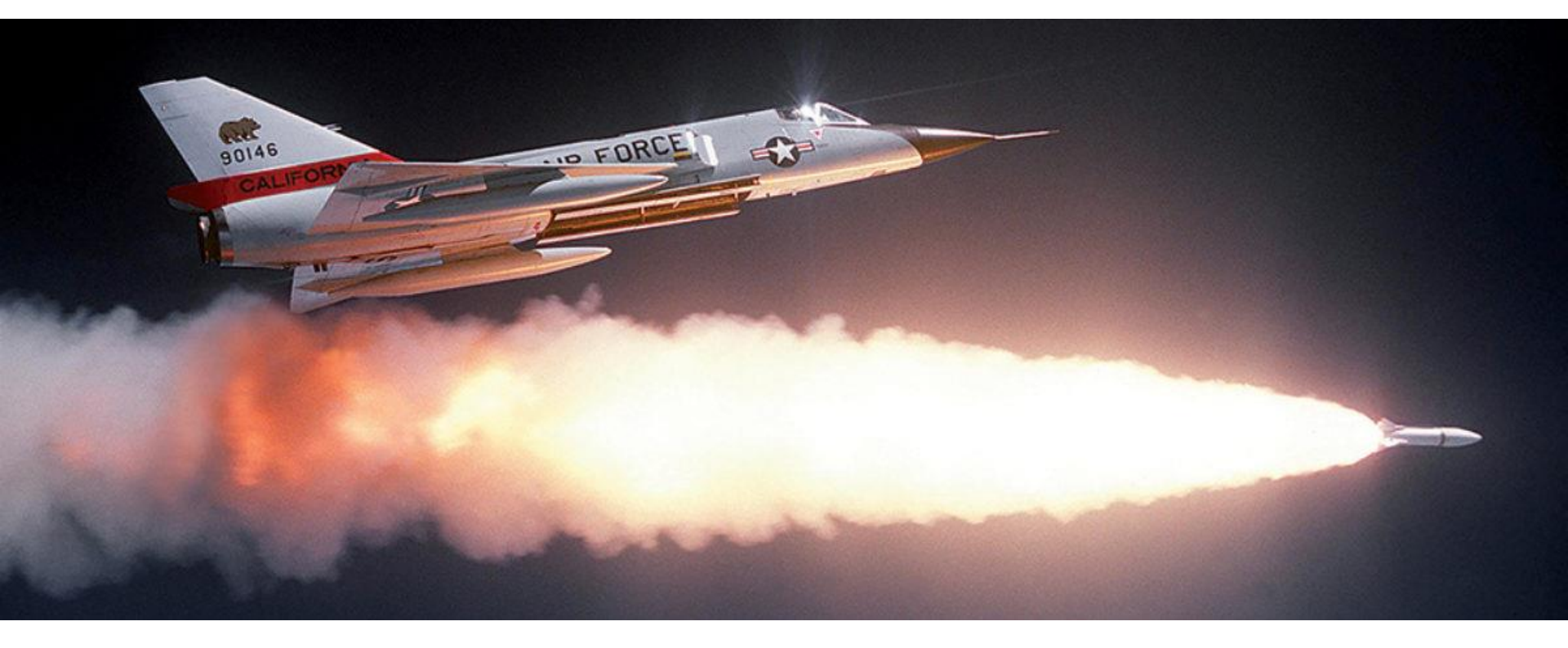
Convair F-106 Delta Dart firing a Douglas AIR-2A Genie Nuclear Rocket