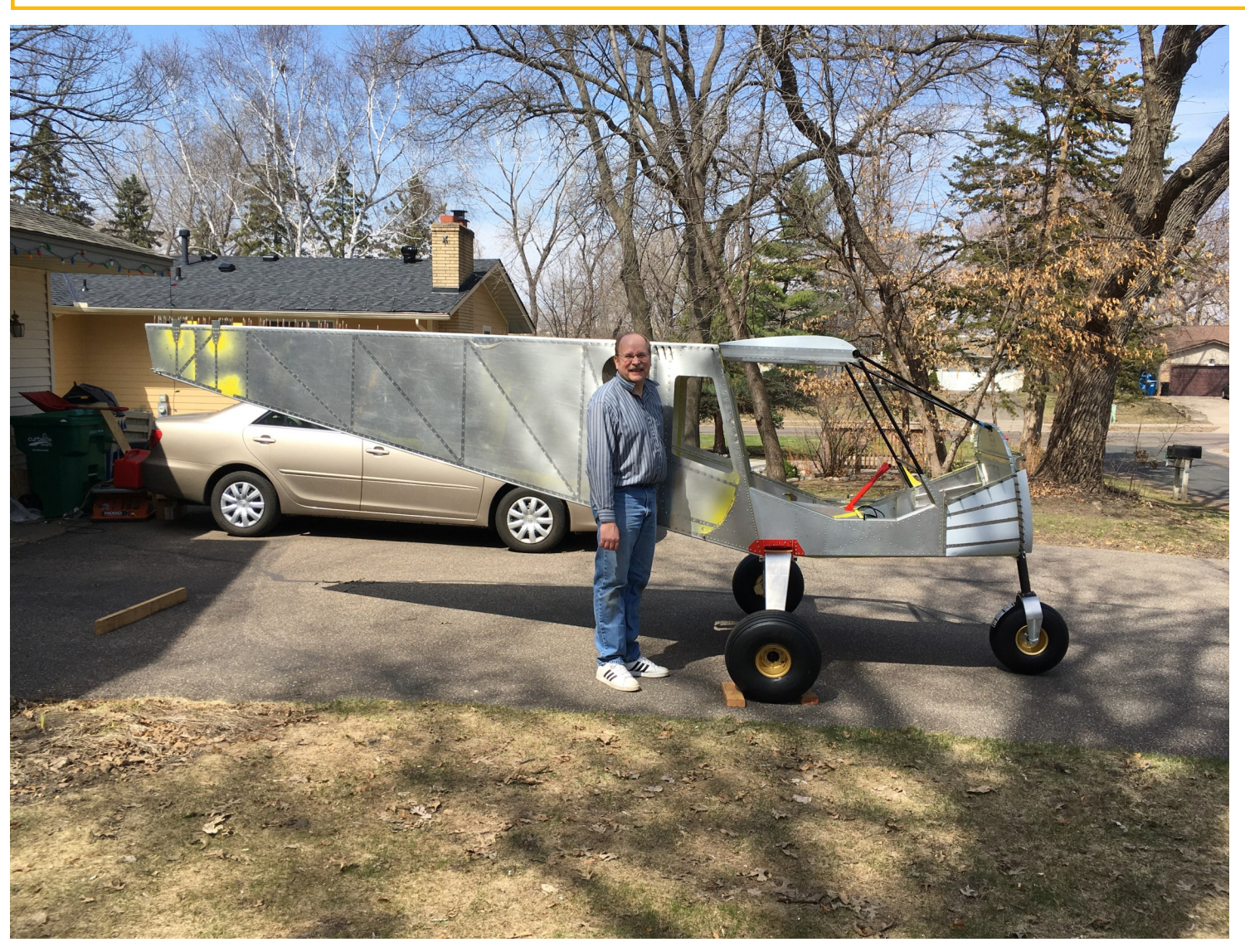
"Major Visual Progress"

Building Committee - So far a party of one. Some of you will receive a tap on the shoulder. This committee will explore the feasibility of a new or expanded building space.