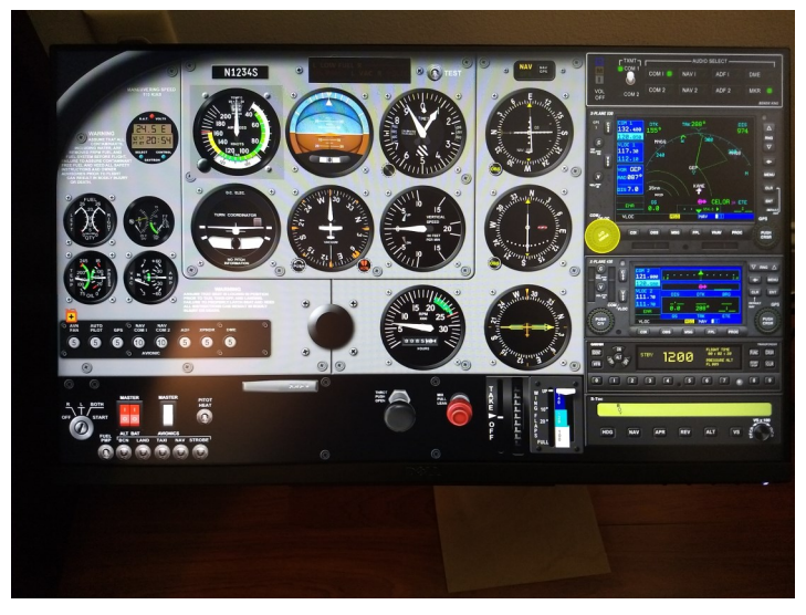
Cont'd on page 3

Three large screen monitors have been purchased and one of the three has been installed to give us an idea on how the other two will be mounted and how this will affect where the various flight controls will need to be mounted. A 24" Dell touch screen has been purchased and delivered to my house. This will be used to provide a functional instrument panel for various types of airplanes using simulation software called Air Manager which interfaces with the X-Plane 11 flight simulator software. Since I also have an X-Plane 11 setup at home this was a good way to check out how this will work for an active