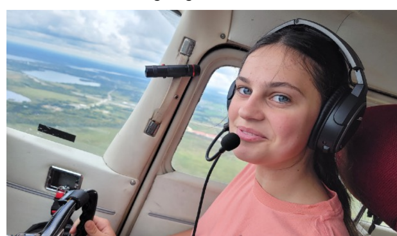
Another happy Young Eagles pilot trying her hand at flying.