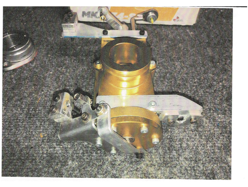
The above Throttle Body Injector is a Rotec TBI MK.II 34-S unit that lists for $910. Will sell for $500