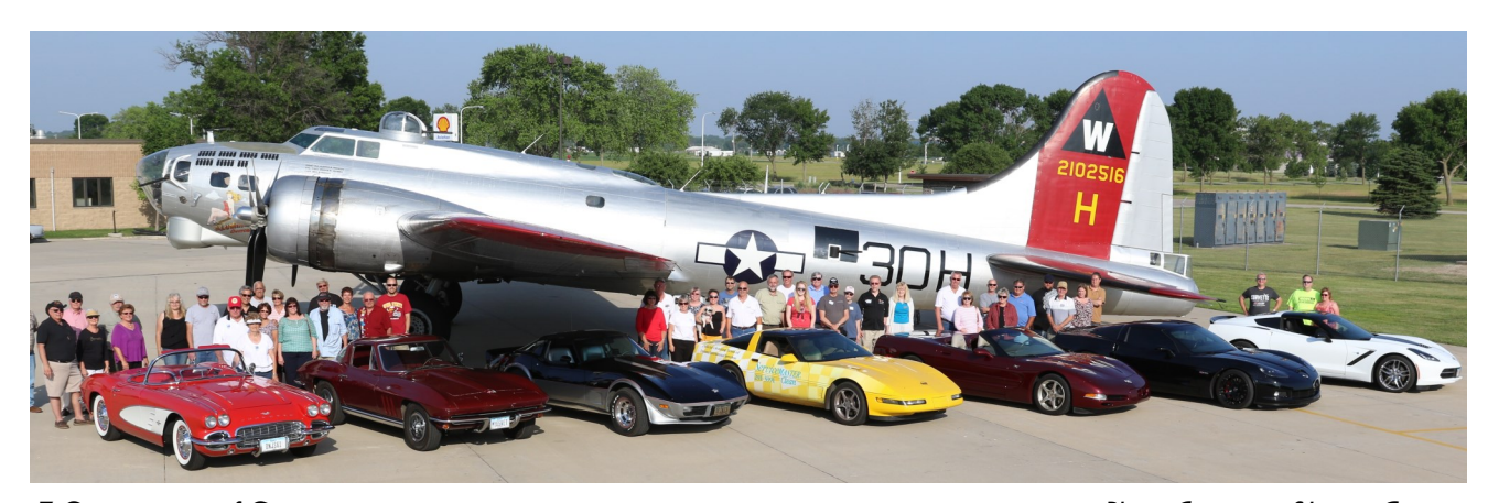
7 Generations of Corvettes

AND TO ALL THE VOLUNTEERS WHO CONTRIBUTED THEIR TIME & TALENT TO THE EVENT!