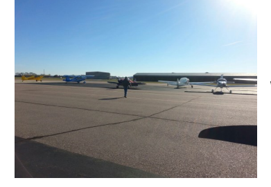
SUPER DAY ! Cold, but very light winds. We had a great time at Lone Rock ( as usual ).