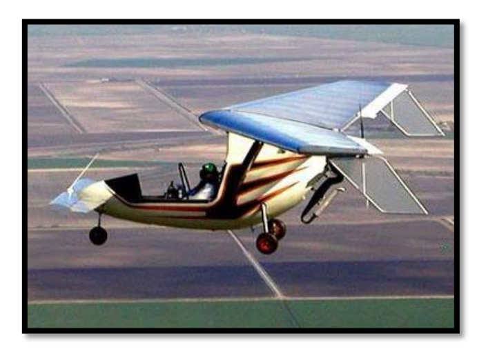
The photo is an example of the airplane that is for sale.

or sale by third owner family. Falcon Ultralight plus trailer. Last flown in the year 2000. Only sold as complete parts plane. $4,500.00. Always hangared or garaged. Ballistic parachute. Custom windscreen cover. UP kit for rudders. NEVER DAMAGED.